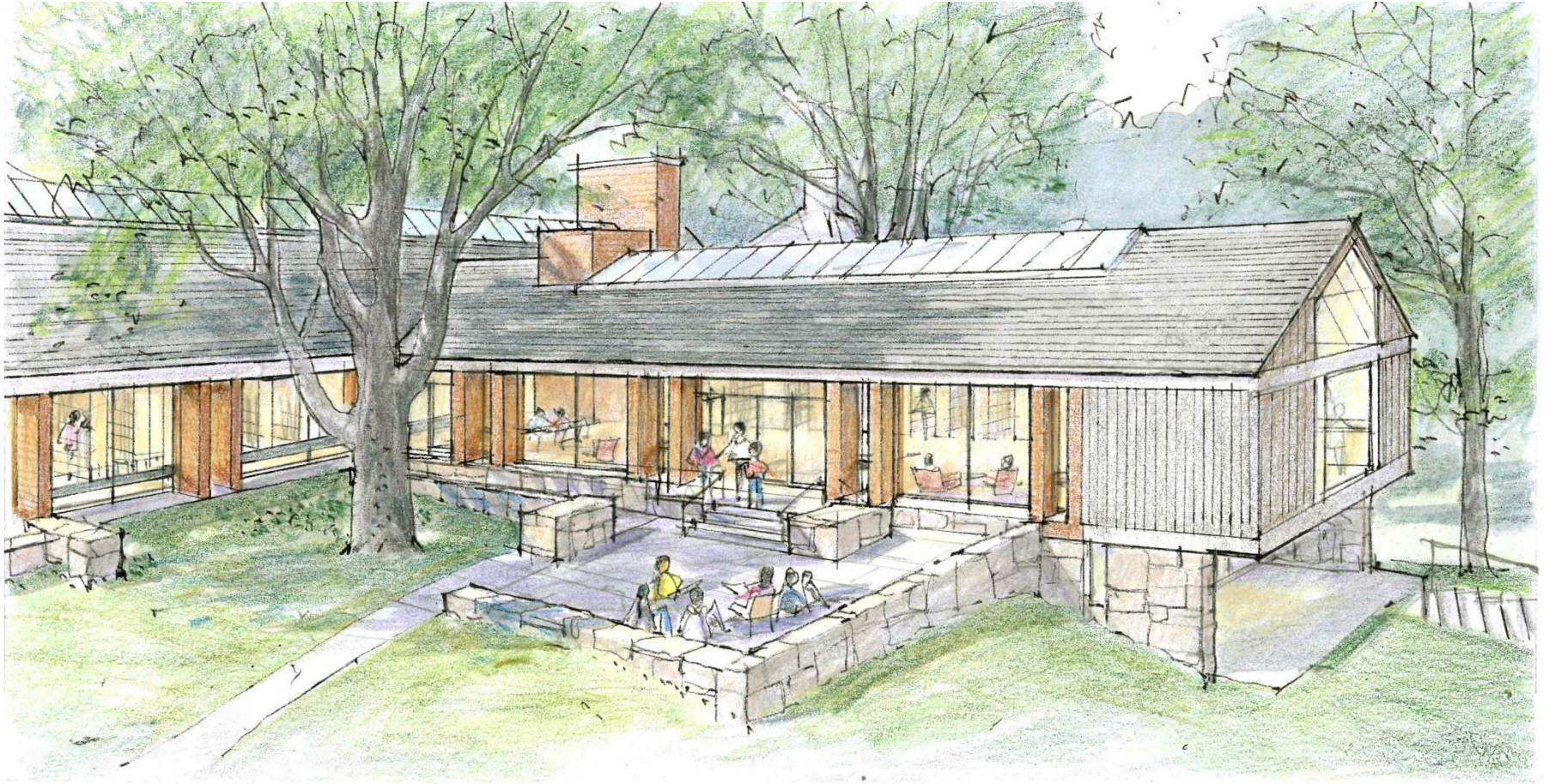
New Children's Wing, Terrace & Garden